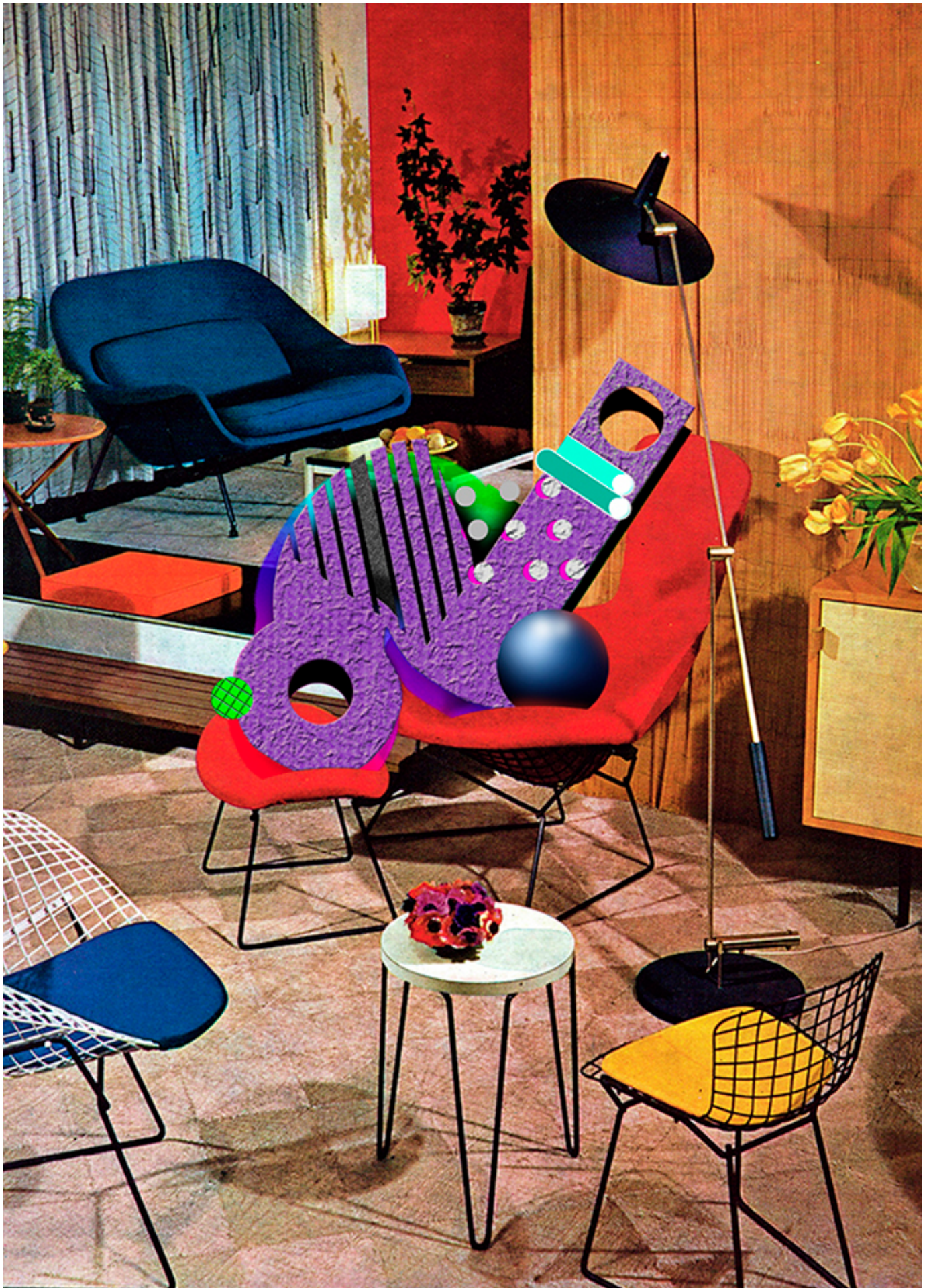
Ad Minoliti, QDECO1 (2011-) GC: In your series of digital collages, PLAY_G and Queer Decó you intervene in, and essentially create geometrical inhabitants for, the images in '60s/'70s Playboy and interior decoration magazines. Can you talk further about the relationship between interior