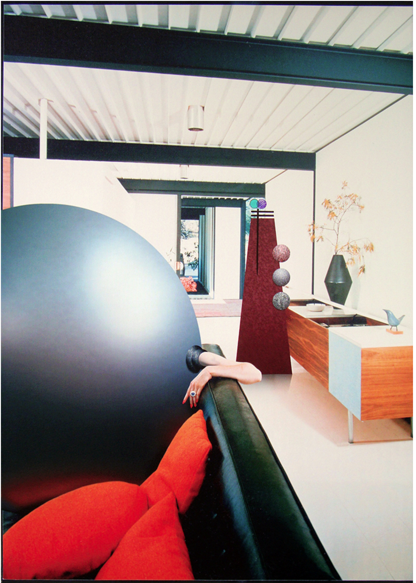
Ad Minoliti, CSH_21 (2015) GC: In most of your painting shows you subvert white cube simplicity, going instead for pastel wall colors, paintings hung in corners, abstract furniture-like objects, and TV